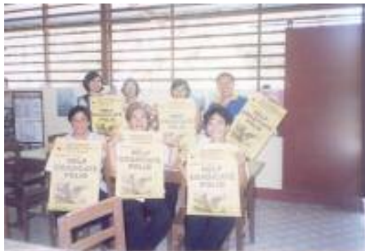
Polio Fund Campaign