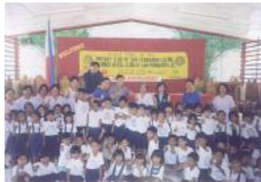
Yes! Polio Eradication Project