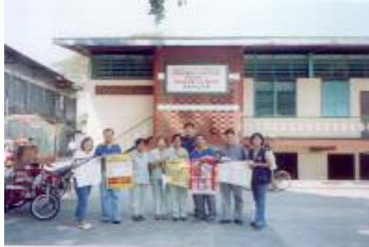
Dengue Awareness Project