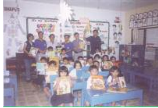
Book Donation - Supiden Central