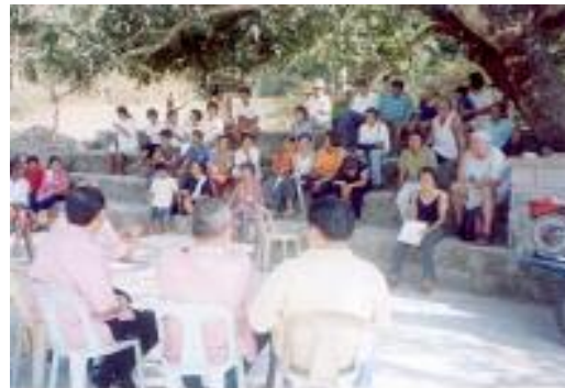
Livelihood Project at Namtutan