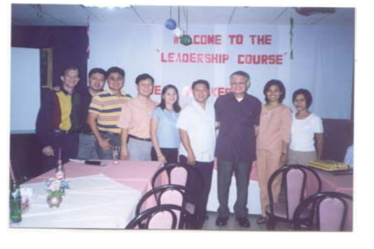
Regular Board meeting at Mandarin Restaurant