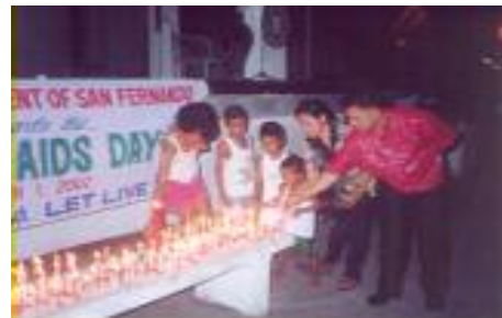
Candle Lighting Ceremony AIDS :Live and Let Live, Dec 1 2002