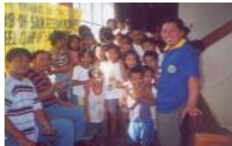
Free Movies for Kids