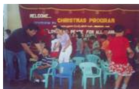
SPED Christmas Party