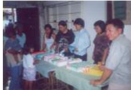
Balaoan Medical Mission