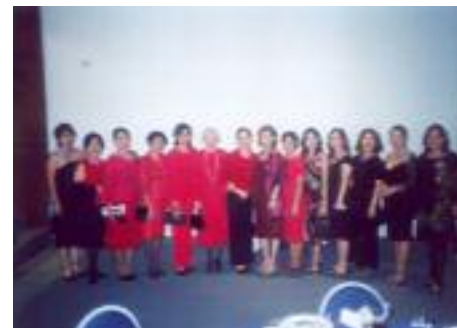
Our Special Guests - Our Inner Wheel Club members