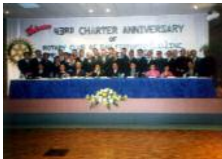
43rd Charter Anniversary of Club "Men In Black"