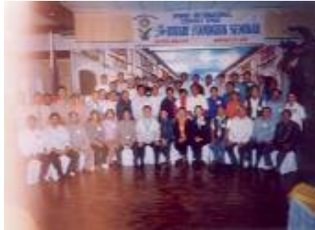
Rotary Foundation Seminar in Vigan