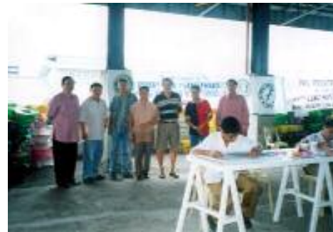
Poster Making Contest of the Lung Month celebration