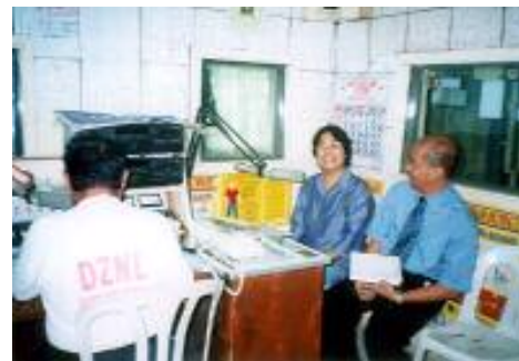
Health Awareness broadcast held at DZNL