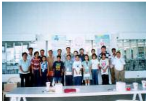
Donors, participants and organizers of the Lung Month celebration