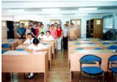
Essay Writing Contest of the Lung Month celebration