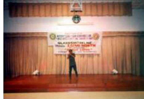
Pwede pa kami, Birit Lung held at CAP Building