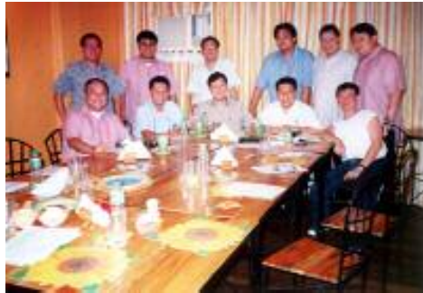
2nd Regular Board Meeting at Gee-o Restaurant