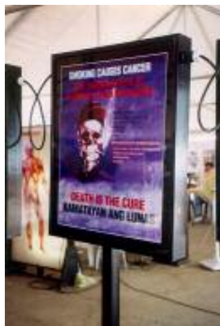
Lung Month Celebration display